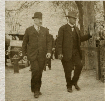
Julius Rosenwald and Booker T. Washington, Tuskegee Institute 1915.

Not only did Julius Rosenwald provide seed funding for 5,300 schools in 16 rural Southern states, he also awarded fellowship grants to African-American intellectuals and artists, including such notables as: Opera Singer: Marian Anderson; Diplomat: Ralph Bunche; Civil Rights Activists: W.E. B. Dubois, and Julian Bond's father (Horace Mann Bond); Dancer: Katherine Dunham; Authors: Ralph Ellison, Langston Hughes, Zora Neale Hurston, James Baldwin; Photographer: Gordon Parks; Painter: Jacob Lawrence; and Sculptor: Augusta Savage.