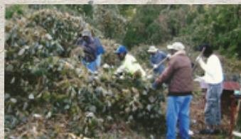
Alumni dig out their school by hand