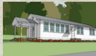
Re-envisioned campus interpreting the original Rosenwald building