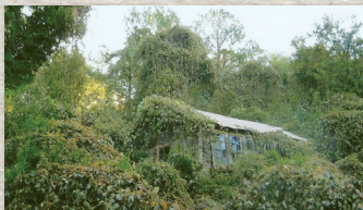
The first grade school building, the only remaining building